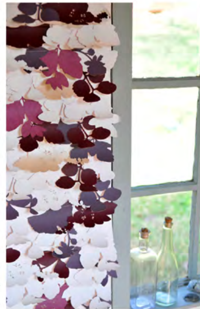
3. Collection wall mural; digitally printed rolls, total area 104 x 300cm.