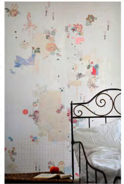
2. Flutter wallpaper; handmade to order, colour matching available, POA.